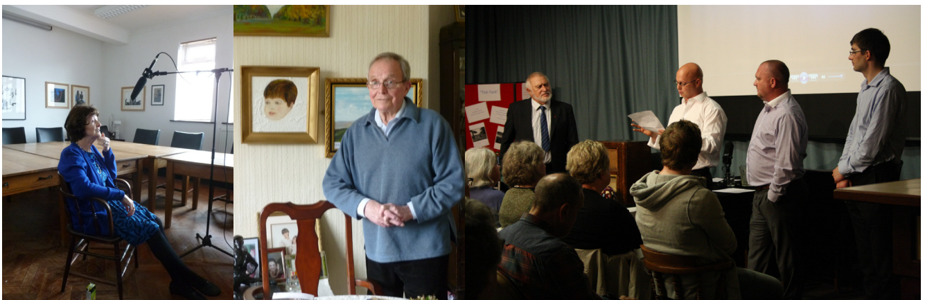
Delweddau (chwith i'r dde) / Images (left to right):