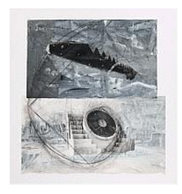
Leonardo Pisano pratica geometriae (2007)

Gouache on paper 1224 x 1163 mm frame: 1492 x 1430 x 90 mm