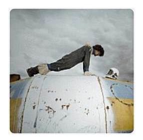
Ubutongo (2012) The Afronauts, P82235-P82271 Photograph, inkjet print on paper 285 x 285 mm Number 2 in an edition of 5 Purchased from the artist with funds provided by Hyundai Card 2018 P82264