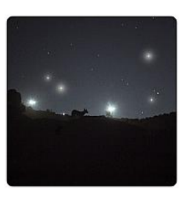
Bongo (2012) The Afronauts, P82235-P82271 Photograph, inkjet print on paper 970 x 970 mm Number 3 in an edition of 5 Purchased from the artist with funds provided by Hyundai Card 2018 P82255