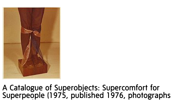
reprinted 2016) 36 photographs, C-prints on paper and 46 works on paper, machine-typed text 253 x 203 mm Number 37 in an edition of 100 Presented by Ronald and Frayda Feldman 2015 P14983