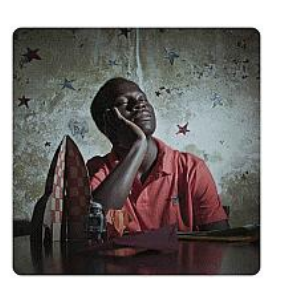
Umfundi (2012) The Afronauts, P82235-P82271 Photograph, inkjet print on paper 970 x 970 mm Number 4 in an edition of 5 Purchased from the artist with funds provided by Hyundai Card 2018 P82249