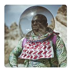
Dhana (2012) The Afronauts, P82235-P82271 Photograph, inkjet print on paper 970 x 970 mm Number 1 in an edition of 5 Purchased from the artist with funds provided by Hyundai Card 2018 P82252