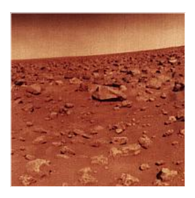
Utopia Planitia. Mars, Sol 58 (c.1974-9)

A New Refutation for the Viking IV Lander, P82327-P82391 Photograph, C-print on paper 187 x 187 mm Presented by Tate Members 2018 P82391