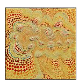
WORK62-W (1962) Oil, gofun and glue on plywood 936 x 935 x 46 mm Purchased from the artist's estate and Anne Mosseri-Marlio Galerie with funds provided by Tate International Council 2019 T15137