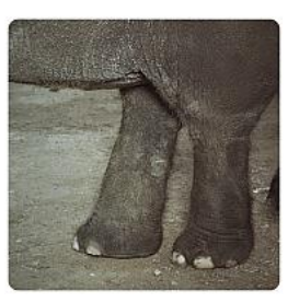
Butunga (2012) The Afronauts, P82235-P82271 Photograph, inkjet print on paper 285 x 285 mm Number 1 in an edition of 5 Purchased from the artist with funds provided by Hyundai Card 2018 P82256