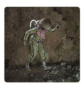
Umeko (2012) The Afronauts, P82235-P82271 Photograph, inkjet print on paper 970 x 970 mm Number 2 in an edition of 5 Purchased from the artist with funds provided by Hyundai Card 2018 P82242