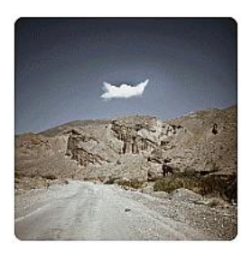
Pulula (2012) The Afronauts, P82235-P82271 Photograph, inkjet print on paper 970 x 970 mm Number 1 in an edition of 5 Purchased from the artist with funds provided by Hyundai Card 2018 P82239