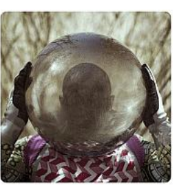
Yinqaba (2012) The Afronauts, P82235-P82271 Photograph, inkjet print on paper 970 x 970 mm Number 1 in an edition of 5 Purchased from the artist with funds provided by Hyundai Card 2018 P82238