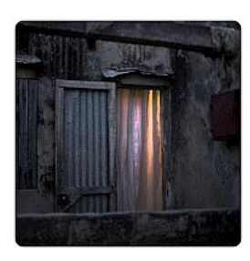
Lala Kale (2012) The Afronauts, P82235-P82271 Photograph, inkjet print on paper 285 x 285 mm Number 4 in an edition of 5 Purchased from the artist with funds provided by Hyundai Card 2018 P82269