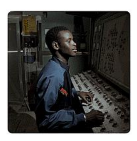
Botonguru (2012) The Afronauts, P82235-P82271 Photograph, inkjet print on paper 970 x 970 mm Number 1 in an edition of 5 Purchased from the artist with funds provided by Hyundai Card 2018 P82254