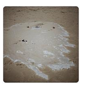
Amanzi (2012) The Afronauts, P82235-P82271 Photograph, inkjet print on paper 285 x 285 mm Number 1 in an edition of 5 Purchased from the artist with funds provided by Hyundai Card 2018 P82261