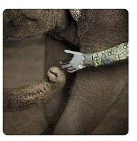
Butungabi (2012) The Afronauts, P82235-P82271 Photograph, inkjet print on paper 285 x 285 mm Number 1 in an edition of 5 Purchased from the artist with funds provided by Hyundai Card 2018 P82262