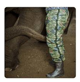
Butungaminga (2012) The Afronauts, P82235-P82271 Photograph, inkjet print on paper 285 x 285 mm Number 1 in an edition of 5 Purchased from the artist with funds provided by Hyundai Card 2018 P82263