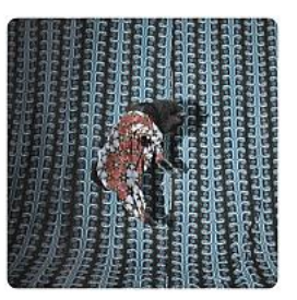
Mayango (2012) The Afronauts, P82235-P82271 Photograph, inkjet print on paper 285 x 285 mm Number 5 in an edition of 5 Purchased from the artist with funds provided by Hyundai Card 2018 P82268