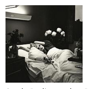
Candy Darling on her Deathbed (1973, printed 2016)

Photograph, inkjet print on paper 375 x 375 mm