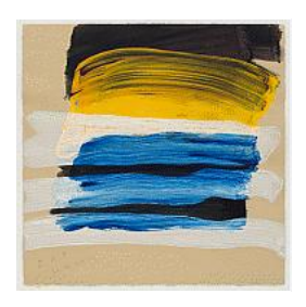
Autumn Sky (2015-16)

Carborundum and acrylic paint on paper 404 \times 405 \text{ mm}