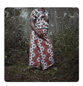
Ukulalana (2012) The Afronauts, P82235-P82271 Photograph, inkjet print on paper 970 x 970 mm Number 1 in an edition of 5 Purchased from the artist with funds provided by Hyundai Card 2018 P82248