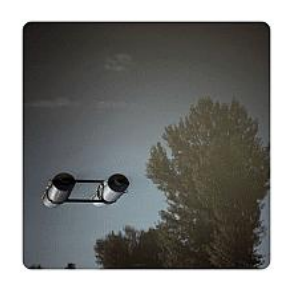
Simba (2012) The Afronauts, P82235-P82271 Photograph, inkjet print on paper 285 x 285 mm Number 3 in an edition of 5 Purchased from the artist with funds provided by Hyundai Card 2018 P82271