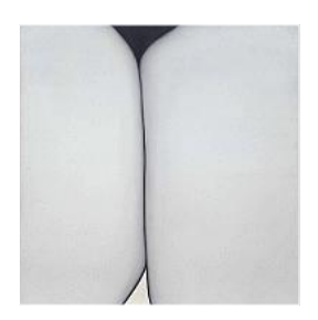
Body Parts (1973) Oil paint on canvas 1202 x 1202 mm frame: 1246 x 1243 x 57 mm Purchased with funds provided by the Middle East and North Africa Acquisitions Committee 2019 T15207