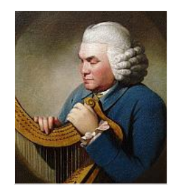
Portrait of John Parry Holding his Harp (1780–90) Oil paint on canvas 994 x 813 x 45 mm Purchased from Miles Wynn Cato, London 2019 T15263