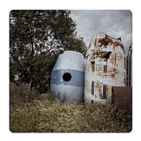
Umgodi (2012) The Afronauts, P82235-P82271 Photograph, inkjet print on paper 285 x 285 mm Number 1 in an edition of 5 Purchased from the artist with funds provided by Hyundai Card 2018 P82258