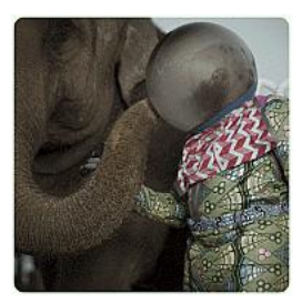
Butungakuna (2012) The Afronauts, P82235-P82271 Photograph, inkjet print on paper 970 x 970 mm Number 2 in an edition of 5 Purchased from the artist with funds provided by Hyundai Card 2018 P82241