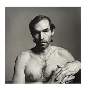
Self Portrait (with a string around his neck) (1980, printed 2018)

Photograph, inkjet print on paper 375 x 375 mm Number 4 in an edition of 10