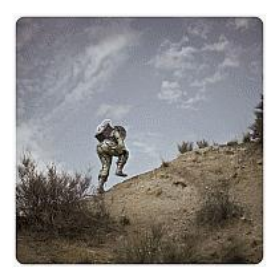
Hamba (2012) The Afronauts, P82235-P82271 Photograph, inkjet print on paper 970 x 970 mm Number 5 in an edition of 5 Purchased from the artist with funds provided by Hyundai