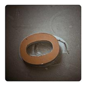
Indilinga (2012) The Afronauts, P82235-P82271 Photograph, inkjet print on paper 285 x 285 mm Number 1 in an edition of 5 Purchased from the artist with funds provided by Hyundai Card 2018 P82266