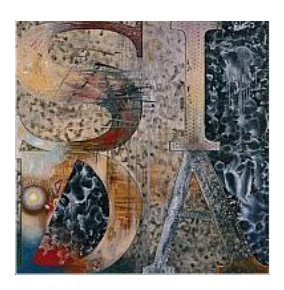
Love (1988) Oil paint on canvas 2000 x 2000 mm

Tate and Museum of Contemporary Art Australia, presented through the Australian Government's Cultural Gifts Program by the artist, and with the support of the Qantas Foundation, 2018