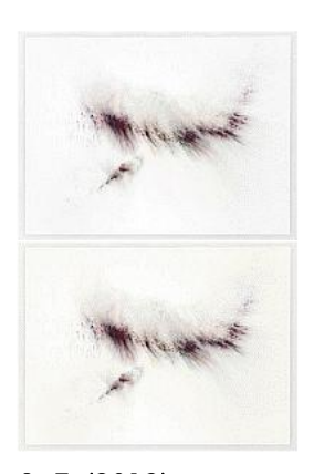
O. T. (2013)

Oil paint and pigment on canvas 1958 x 2646 x 109 mm Presented by the artist and Charles Asprey 2018 T15070