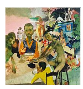
9PM, the News (2015) Oil paint on canvas 2503 x 2456 mm Purchased from Aicon Gallery, New York, with funds provided by the Nicholas Themans Trust 2019 T15136