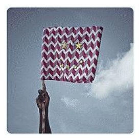
Ifulegi (2012) The Afronauts, P82235-P82271 Photograph, inkjet print on paper 970 x 970 mm Number 2 in an edition of 5 Purchased from the artist with funds provided by Hyundai Card 2018 P82253