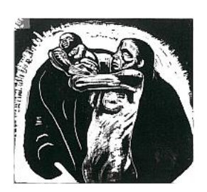
The Sacrifice (1922) War, P82459-P82465 Woodcut on paper 368 x 400 mm Purchased from Dr Franz Engelmann with assistance from Tate Patrons 2019 P82459