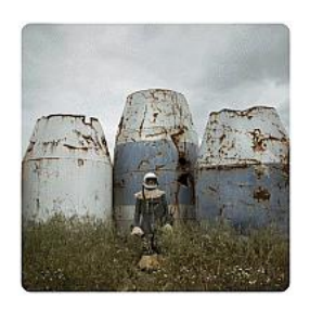
Isimema (2012) The Afronauts, P82235-P82271 Photograph, inkjet print on paper 285 x 285 mm Number 1 in an edition of 5 Purchased from the artist with funds provided by Hyundai Card 2018 P82265