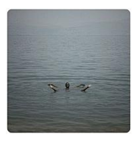
Katunga (2012) The Afronauts, P82235-P82271 Photograph, inkjet print on paper 970 x 970 mm Number 1 in an edition of 5 Purchased from the artist with funds provided by Hyundai