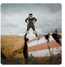
Inselele (2012) The Afronauts, P82235-P82271 Photograph, inkjet print on paper 970 x 970 mm Number 4 in an edition of 5 Purchased from the artist with funds provided by Hyundai Card 2018 P82250