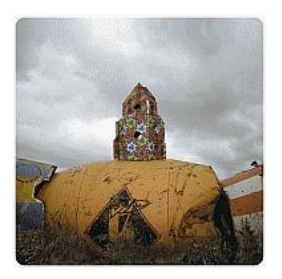
Kulunguele (2012) The Afronauts, P82235-P82271 Photograph, inkjet print on paper 970 x 970 mm Number 1 in an edition of 5 Purchased from the artist with funds provided by Hyundai Card 2018 P82246