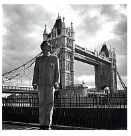
London, England (Tower Bridge) (1983) Photograph, gelatin silver print on paper 900 x 900 mm Number 4 in an edition of 9 plus 2 artist's proofs Presented by the artist's estate through Ben Brown Fine Arts, London 2019 P14982