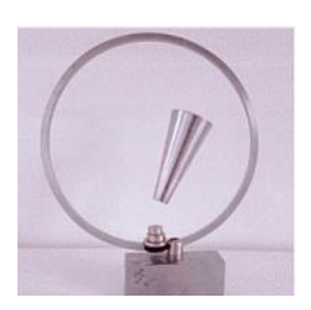
Magnetic (c.2000) Aluminium, steel, magnet and nylon 393 x 330 x 50 mm Presented by an anonymous donor 2015, accessioned 2019