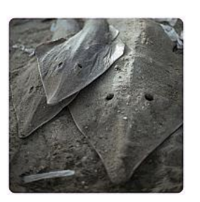
Kilimanju (2012) The Afronauts, P82235-P82271 Photograph, inkjet print on paper 285 x 285 mm Number 1 in an edition of 5 Purchased from the artist with funds provided by Hyundai Card 2018 P82267