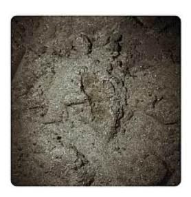
Umunka (2012) The Afronauts, P82235-P82271 Photograph, inkjet print on paper 285 x 285 mm Number 1 in an edition of 5 Purchased from the artist with funds provided by Hyundai Card 2018 P82257