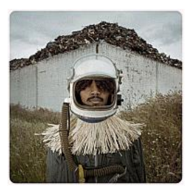
Jambo (2012) The Afronauts, P82235-P82271 Photograph, inkjet print on paper 970 x 970 mm Number 4 in an edition of 5 Purchased from the artist with funds provided by Hyundai Card 2018 P82247