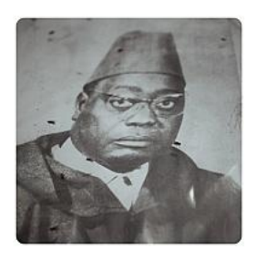
Bwana (2012) The Afronauts, P82235-P82271 Photograph, inkjet print on paper 285 x 285 mm Number 1 in an edition of 5 Purchased from the artist with funds provided by Hyundai Card 2018 P82260