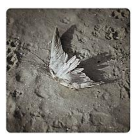
Inyoni (2012) The Afronauts, P82235-P82271 Photograph, inkjet print on paper 285 x 285 mm Number 2 in an edition of 5 Purchased from the artist with funds provided by Hyundai Card 2018 P82259