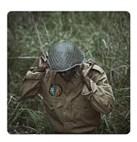
Ikanda (2012) The Afronauts, P82235-P82271 Photograph, inkjet print on paper 970 x 970 mm Number 1 in an edition of 5 Purchased from the artist with funds provided by Hyundai Card 2018 P82251