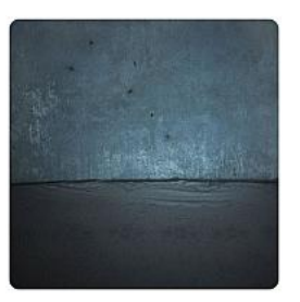
Angani (2012) The Afronauts, P82235-P82271 Photograph, inkjet print on paper 970 x 970 mm Number 1 in an edition of 5 Purchased from the artist with funds provided by Hyundai Card 2018 P82244