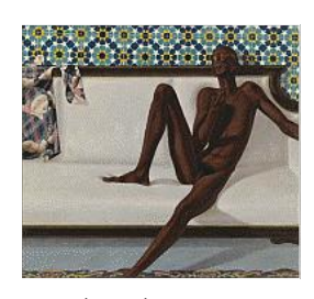
Family Jules: NNN (No Naked Niggahs) (1974)

Oil paint on canvas 1681 \times 1832 mm Presented by the American Fund for the Tate Gallery, courtesy of the North American Acquisitions Committee 2015