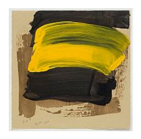
Late Autumn (2015-16)

Aquatint and acrylic paint on paper 406 \times 402 \text{ mm}