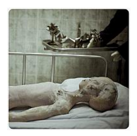
Aumbawe (2012) The Afronauts, P82235-P82271 Photograph, inkjet print on paper 285 x 285 mm Number 1 in an edition of 5 Purchased from the artist with funds provided by Hyundai Card 2018 P82270