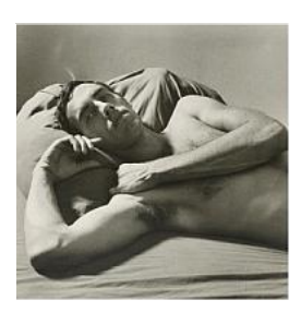
David Wojnarowicz Reclining (II) (1981, printed 2018)

Photograph, inkjet print on paper 375 x 375 mm Number 1 in an edition of 10