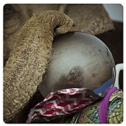
Butungatanatulu (2012) The Afronauts, P82235-P82271 Photograph, inkjet print on paper 970 x 970 mm Number 1 in an edition of 5 Purchased from the artist with funds provided by Hyundai Card 2018 P82240