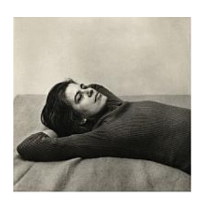
Susan Sontag (1975, printed 2018)

Photograph, inkjet print on paper 375 x 375 mm